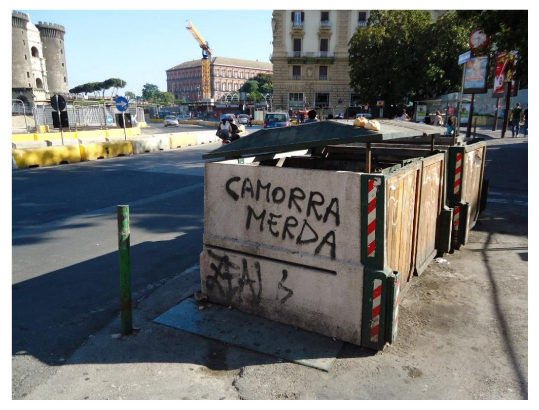
Figure 1—Protesting organised crime in Naples, Italy

Yet, with organised crime, it is already a "shadow government." Its shadow systems that are currently in place are under organised crime's firm control (Liddick, 2008: 1); take for example, some well-known regions in southern Italy (figure 1). Organised crime sits outside the control of civil society (Reid, 2014), and therefore, making these organisations low-profile targets for law enforcement. It is argued that organised crime is invisible; terrorism is highly visible.